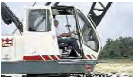
Environmental operator's cab

Max. Lifting Capacity: 50 tons (45.4 mt)