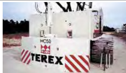
Hydraulic removable counterweight system