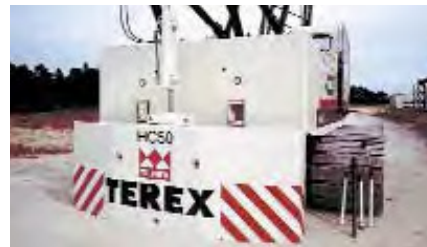
Hydraulic removable counterweight system