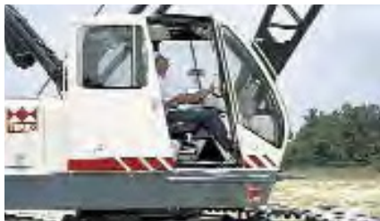
Environmental operator's cab

Max. Lifting Capacity: 50 tons (45.4 mt)